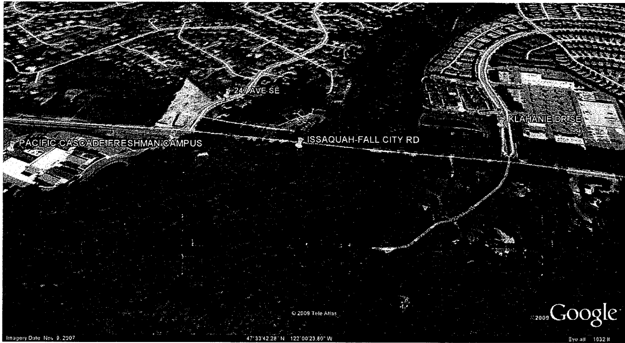
SE Issaquah-Fall City Road

The RSD has received approval from the state to obligate the $795,000 of grant funds. The RSD has been in close communication with the Issaquah School District and both parties concurred the delay in completing the project is far outweighed by the added benefits of the lighting and concrete sidewalk made possible by the grant monies. The project has been advertised and bids opened on December 2, 2009. The preliminary review of the bids is very favorable and the project should be completed under budget. The project is expected to be underway by early January. RSD continues to work closely with the Issaquah School District.